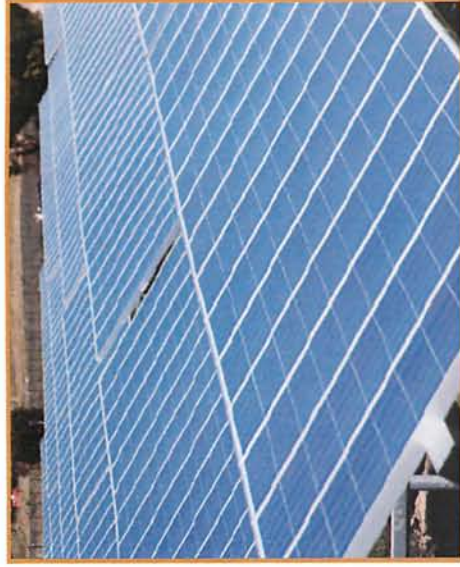
In 2006 Napa Valley College became solar-powered.

The serene, 160-acre main campus includes outstanding laboratories and technical facilities, fully accessible classrooms, a Child Development Center, a six-acre vineyard and the Napa Valley Vintners' Teaching Winery.